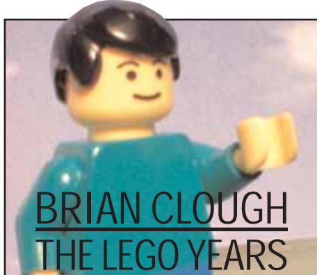
BRIAN CLOUGH THE LEGO YEARS